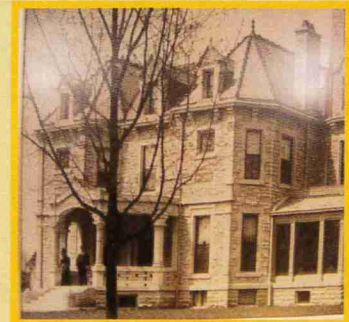
Major Hospital yesterday...

A society of individuals who have included the MHP Foundation in their estate plans.